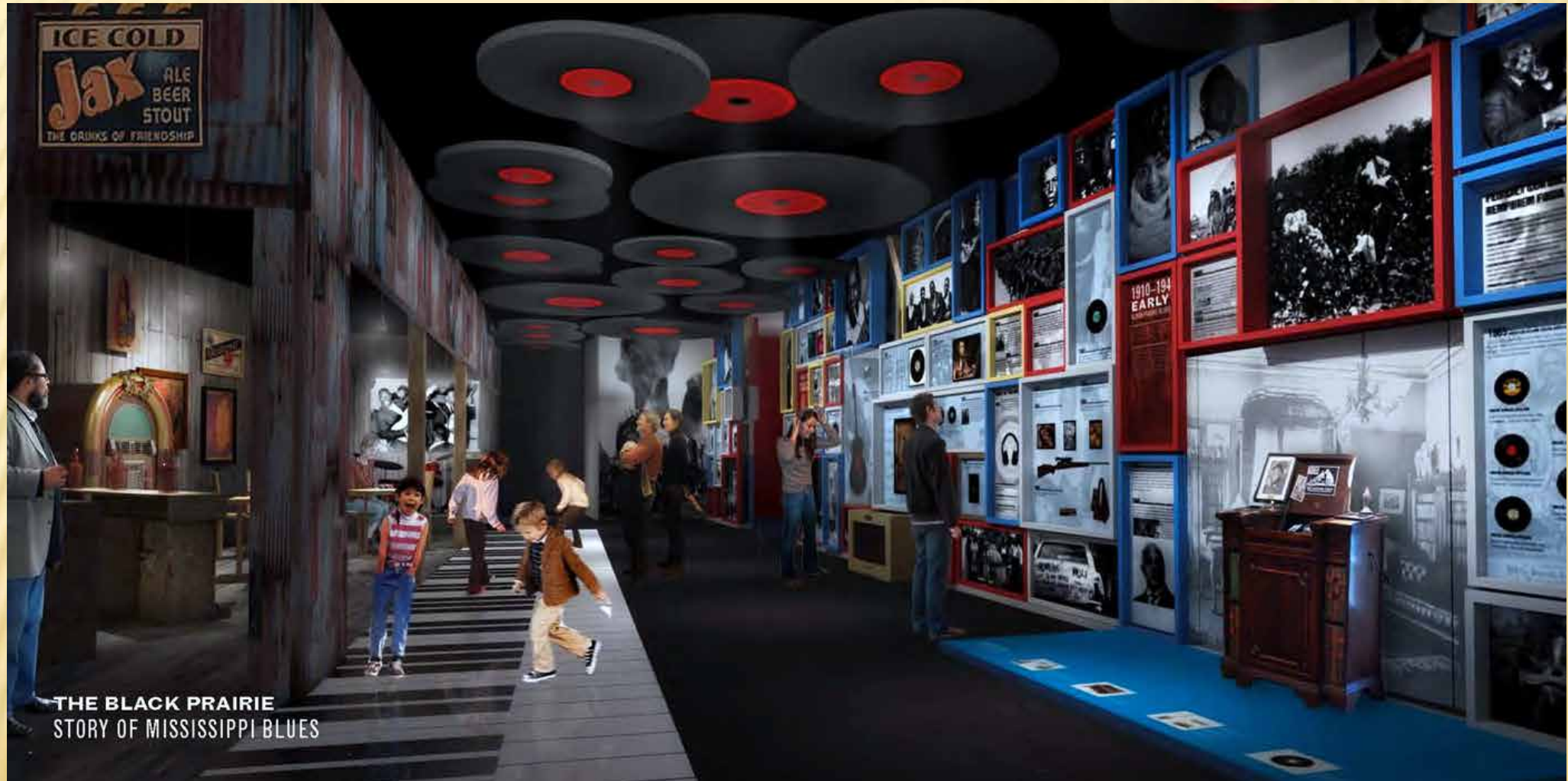
THE BLACK PRAIRIE STORY OF MISSISSIPPI BLUES